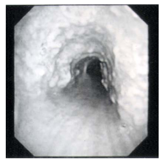
Figure 2. Fiberoptic bronchoscopic view of the trachea, showing multiple, irregular nodular protusions from the mucosa in the typical 'Rock garden' pattern.